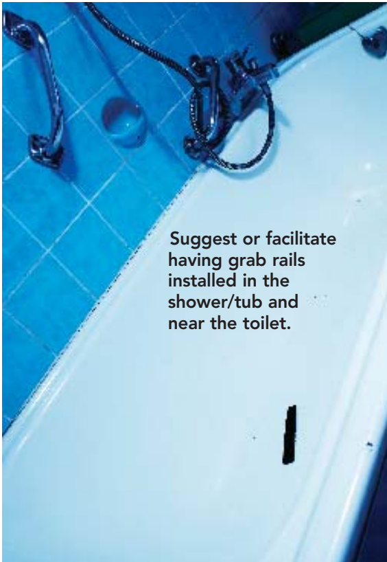
Suggest or facilitate having grab rails installed in the shower/tub and near the toilet.