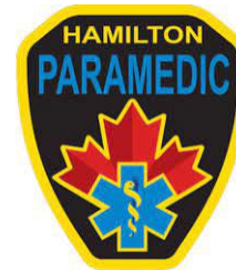
Hamilton Paramedic Service