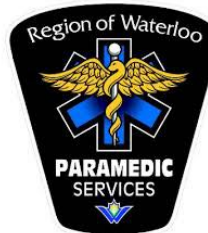
Waterloo Paramedic Services