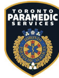
Toronto Paramedic Services