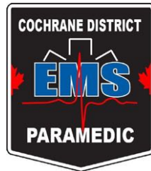
Cochrane District Paramedic Service